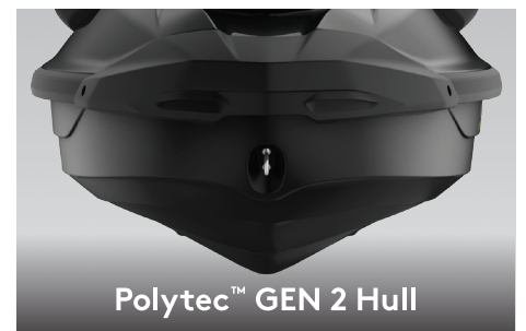
Polytec™ GEN 2 Hull

This exclusive Sea-Doo® feature optimizes power output for up to 46% improved fuel efficiency. 1