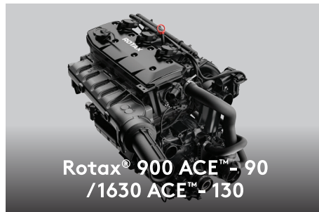
Rotax® 900 ACE™ - 90 /1630 ACE™ - 130

Exclusive to Sea-Doo®, iBR® stops the watercraft sooner and provides more control and maneuverability at low speeds and in reverse.