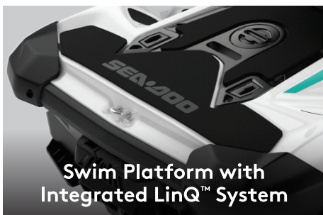
Swim Platform with Integrated LinQ™ System

An impressive 40 gallons of sealed storage space allows riders to safely stow belongings while riding.