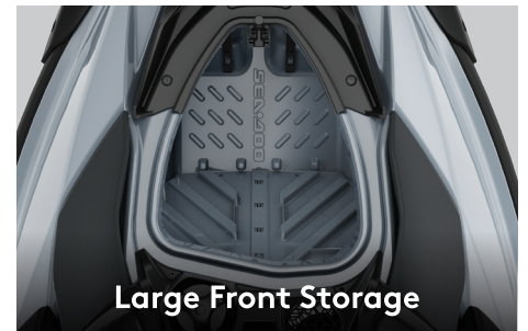
Large Front Storage

The Rotax® 900 ACE™ - 90 gives crisp acceleration with impressive fuel economy and for those who want added performance, the extra horsepower of the 1630 ACE™ - 130 is all about fun and acceleration.